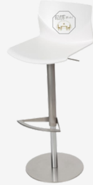
BIELLA BAR STOOL