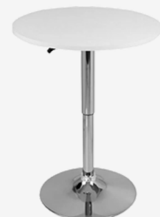
WHITE LIFT DESK TABLE WHITE 69,00€

White Lift Desk Table (60-80cm) Round Negotiation Table