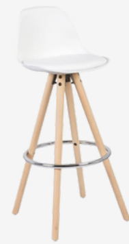
WOLTU BAR DESIGN STOOL WHITE