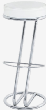
BAR STOOL Z