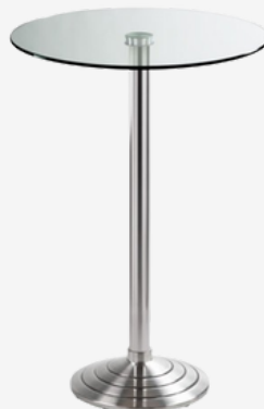
ATTEN STANDING TABLE 88,00€

Height 110" Diameter Table Top 60" Diameter Base Plate 45"