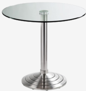
ATTEN SITTING TABLE 79,00€

Height 73" Diameter Table Top 60" Diameter Base Plate 45"