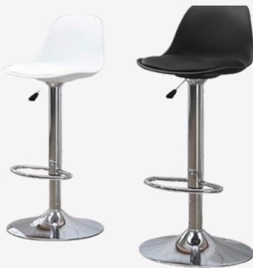
MINGYI PUCHAIR BAR STOOL WHITE/BLACK