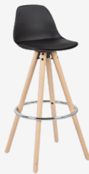
WOLTU BAR DESIGN STOOL BLACK