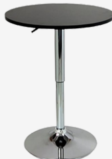
WHITE LIFT DESK TABLE BLACK 69,00€

Glastisch 70, Basis aus Metall, 70x60x60 cm