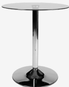
GLASS TABLE 70 79,00€

Height 70" Diameter Table Top 60" Diameter Base Plate 45"