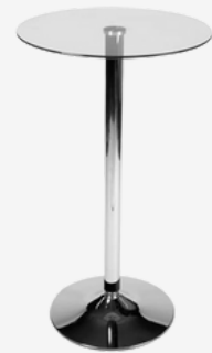
CLP BAR TABLE 89,00€

Dark oak solid wood, light oak decor, white, satin glass, clear glass, black, walnut decor